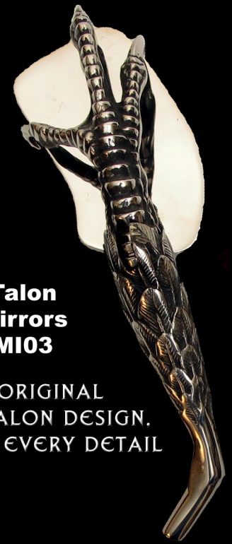
Talon Mirrors MI03

TRUE TO LIFE SKELETON HANDS MOVE AT THE WRIST FOR MIRROR ADJUSTMENTS.