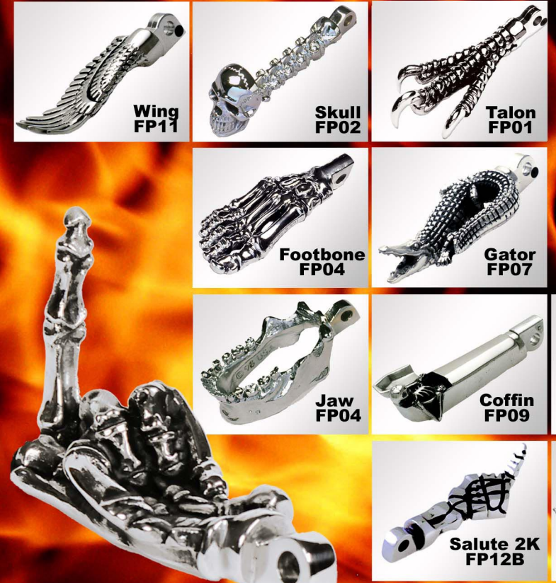
NEW! Salute FP12